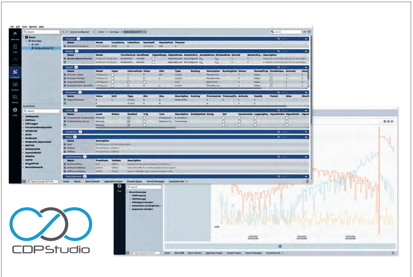
Figure 2: The CDP Studio development environment covers coding, GUI design, system configuration and run-time analysis.

The IPC is a rather generic term, ranging from powerful industrial servers to small DIN-rail modules. The small IPCs are very well suited for edge computing. For headless (no screen) computers, Linux is now finding more and more acceptance. Linux is already powering most of the world's webservers and cloud services, so finding use in Fog computing should not be a surprise. IPCs are now available from multiple vendors and is posing competition to the big "Automation companies". The IPC for edge computing is just a flexible controller with one or two Ethernet interfaces. The hardware vendor lock-in has completely disappeared as applications run on top of standard operating systems. Remote I/O from the automation world hooks nicely up with Linux computers from the IT world, typically via Modbus TCP. CDP Studio comes with a choice of several pre-configured bus couplers and I/O modules from different vendors like Phoenix Contact, Wago, Weidmüller, and Beckhoff.